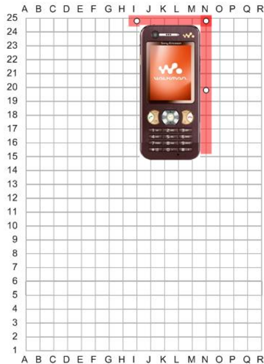
Rohde & Schwarz Shield Box and Coupler (N25)